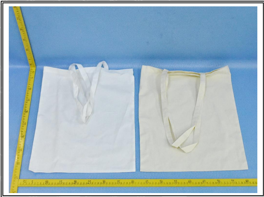
Photographs of parts tested: