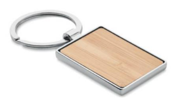
Item number MO9961

This way we offer everyone access to sustainable products at attractive prices. We want our customers to recognize our sustainable products and understand why the item is sustainable, this will then allow an educated choice when selecting a product from our collection.