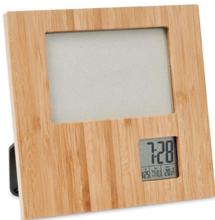
Item number MO9695

This way we offer everyone access to sustainable products at attractive prices. We want our customers to recognize our sustainable products and understand why the item is sustainable, this will then allow an educated choice when selecting a product from our collection.