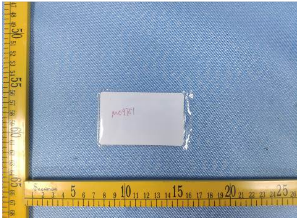
Photo 1 - Sample