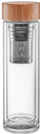
Item number MO9420

This way we offer everyone access to sustainable products at attractive prices. We want our customers to recognize our sustainable products and understand why the item is sustainable, this will then allow an educated choice when selecting a product from our collection.