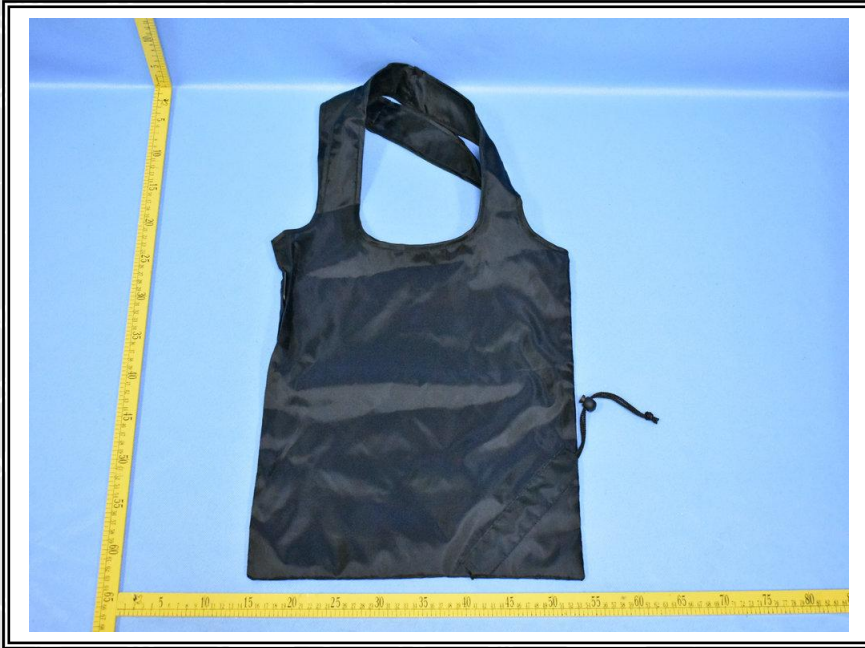
Photographs of parts tested: