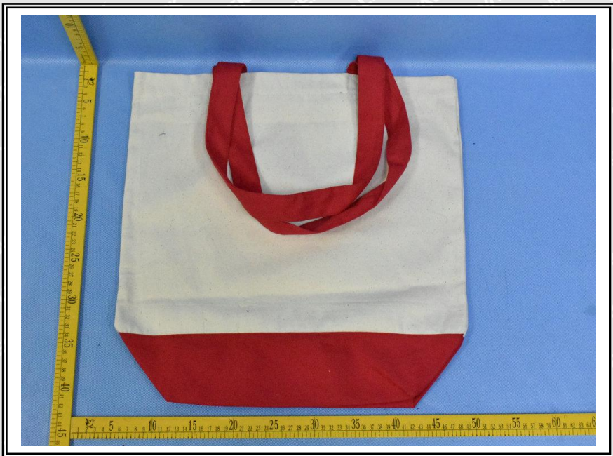
Photographs of parts tested: