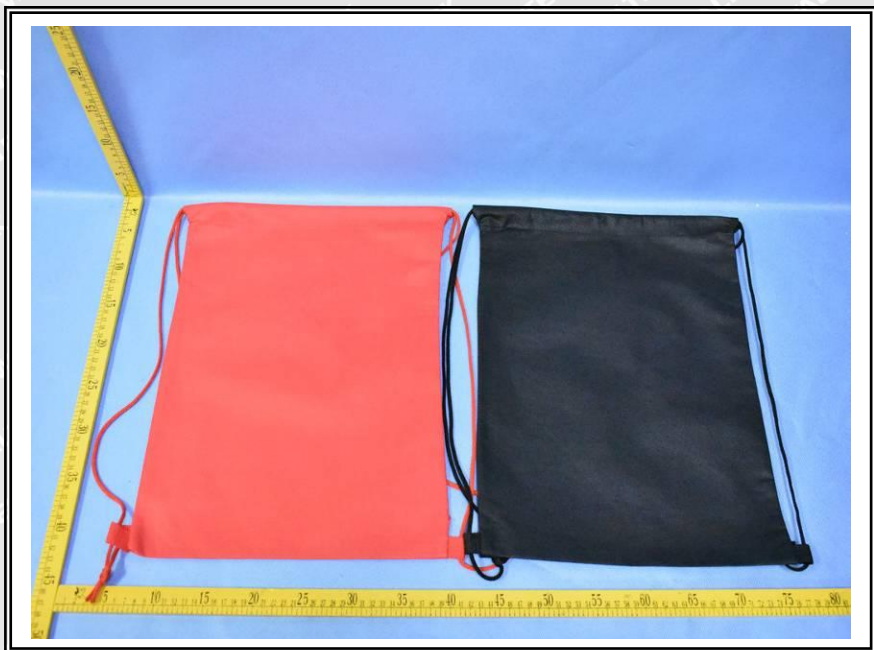
Photographs of parts tested: