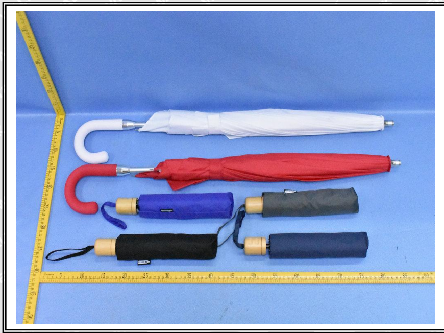
Photographs of parts tested: