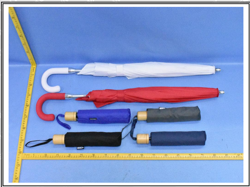
Photographs of parts tested: