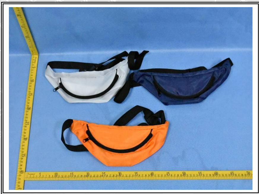
Photographs of parts tested: