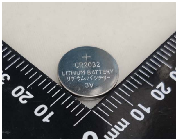
Cell/电芯 (CR2032 3V 210mAh)