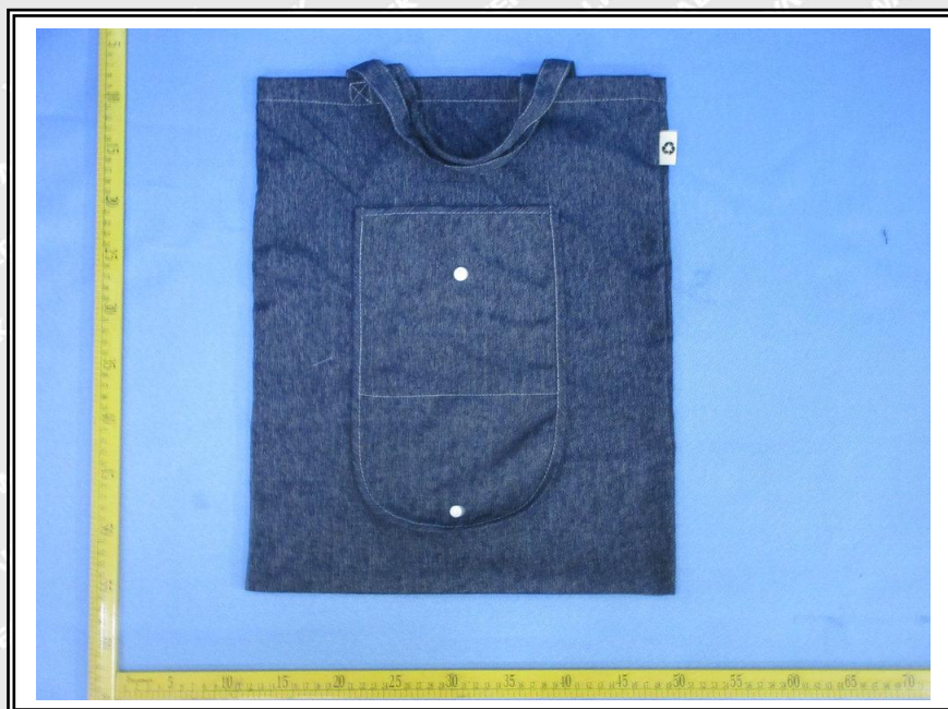
Photograph of parts tested: